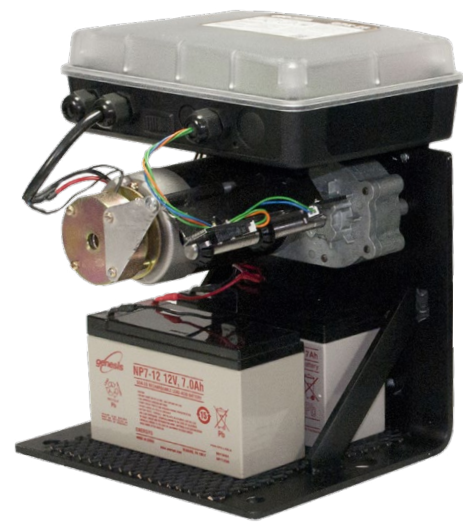
The GPX-SL25 series will handle gates weighing up to 650 lbs. (294.8 kg) and 24 ft. (7.3 m) in length with a 20 ft. (6.1 m) opening, if all proper installation procedures have been followed. Note: ball bearing rollers should be used on all gates.