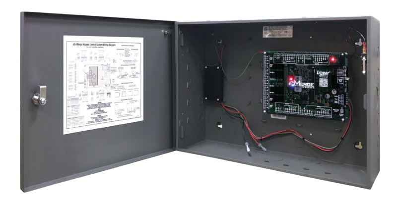
e3 Essential & Elite Systems

Comprehensive embedded OS and browser-managed access systems