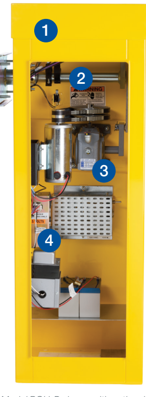
Model BGU-D shown with optional thermostatically controlled heater