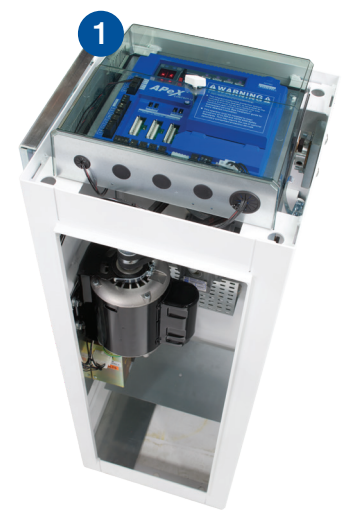
Model BGU top view