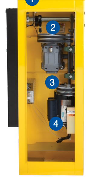
Model BGUS shown with optional thermostatically controlled heater