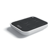
ON4E/A Era One 4 channel radio transmitter