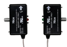
MK00649 Photo eyes