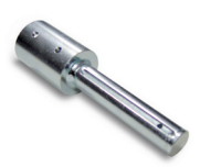
GAP13101 Adapter for 1" and 1.25" diameter shafts